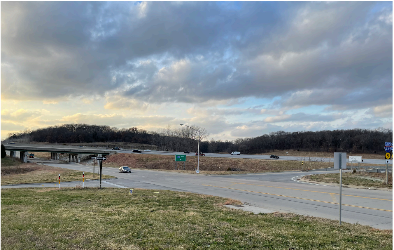
Facing Northwest on Donahoo Rd, Subject Property on Southeast (left) corner of I-435 On Ramp