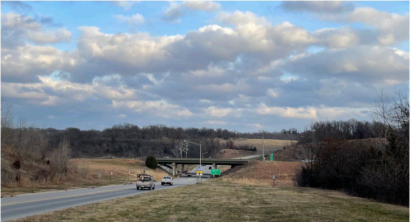
Facing East on Donahoo Rd, Looking at Land Beyond I-435 Overpass