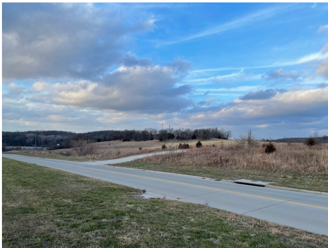
Looking Northwest; North Property Line Donahoo Access Rd