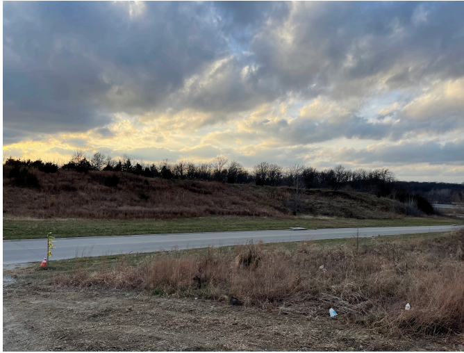
Looking Southwest; North Property Line along Donahoo Rd