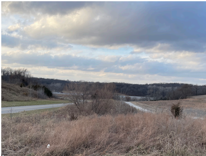
Looking West; North Property Line along Donahoo Rd